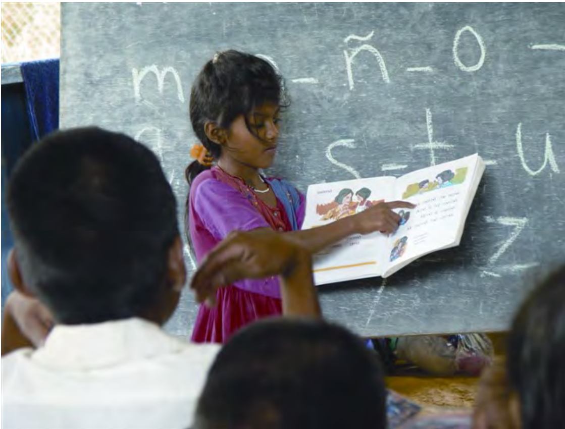
Children must have the possibility to go to school: Rainforest school Patuca, Honduras