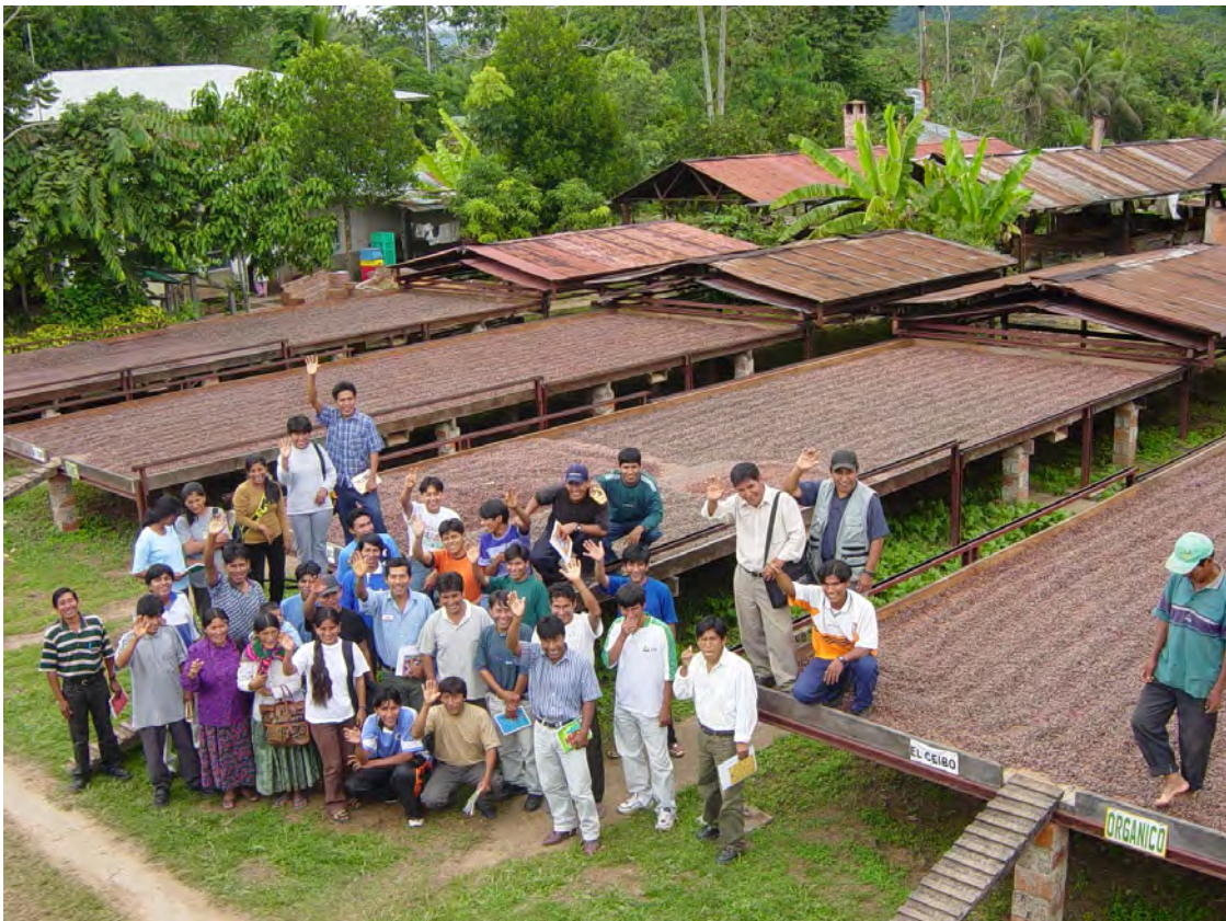
El Ceibo, Bolivia: Members of the cocoa cooperative

Farmer cooperatives / associations and farmers employing (seasonal) workers must comply with the minimum criteria for enterprises with permanent and/or seasonal employees / workers set out in 4.4