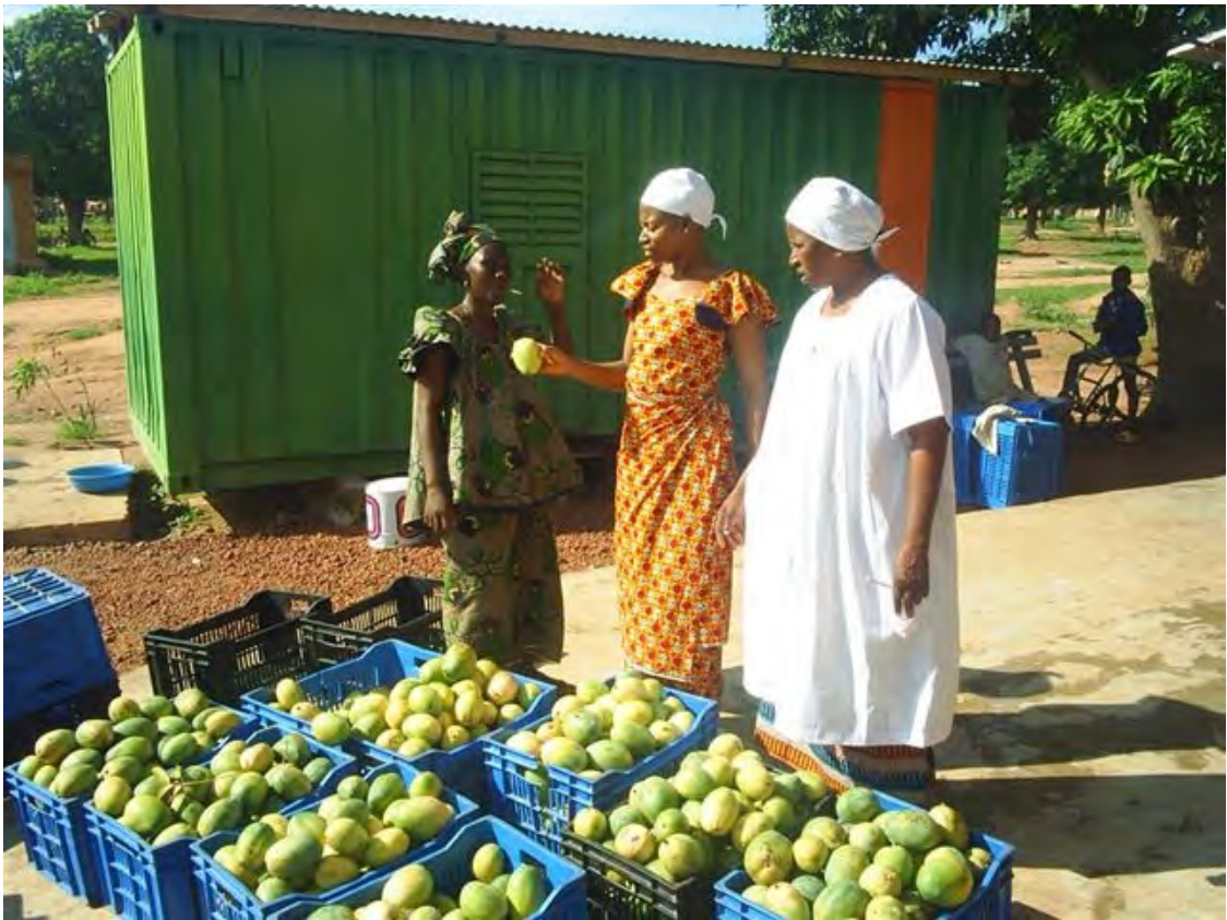
Quality control by women working in the processing of organic mangos for Burkiniture in Burkina Faso