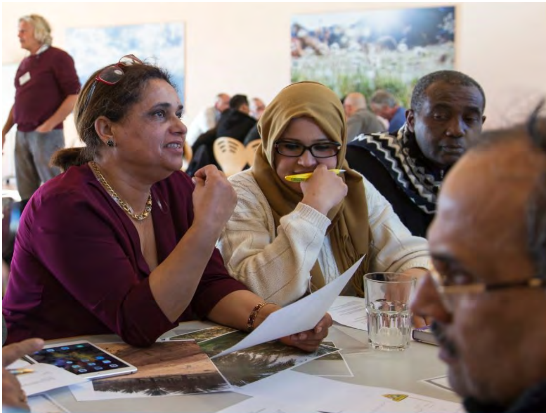
HAND IN HAND workshop at Rapunzel: Regular meeting point and opportunity for interesting exchange for the HAND IN HAND partners from all over the world