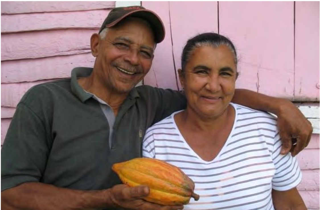
HAND IN HAND and organic: Cocoa farmers in the Dominican Republic