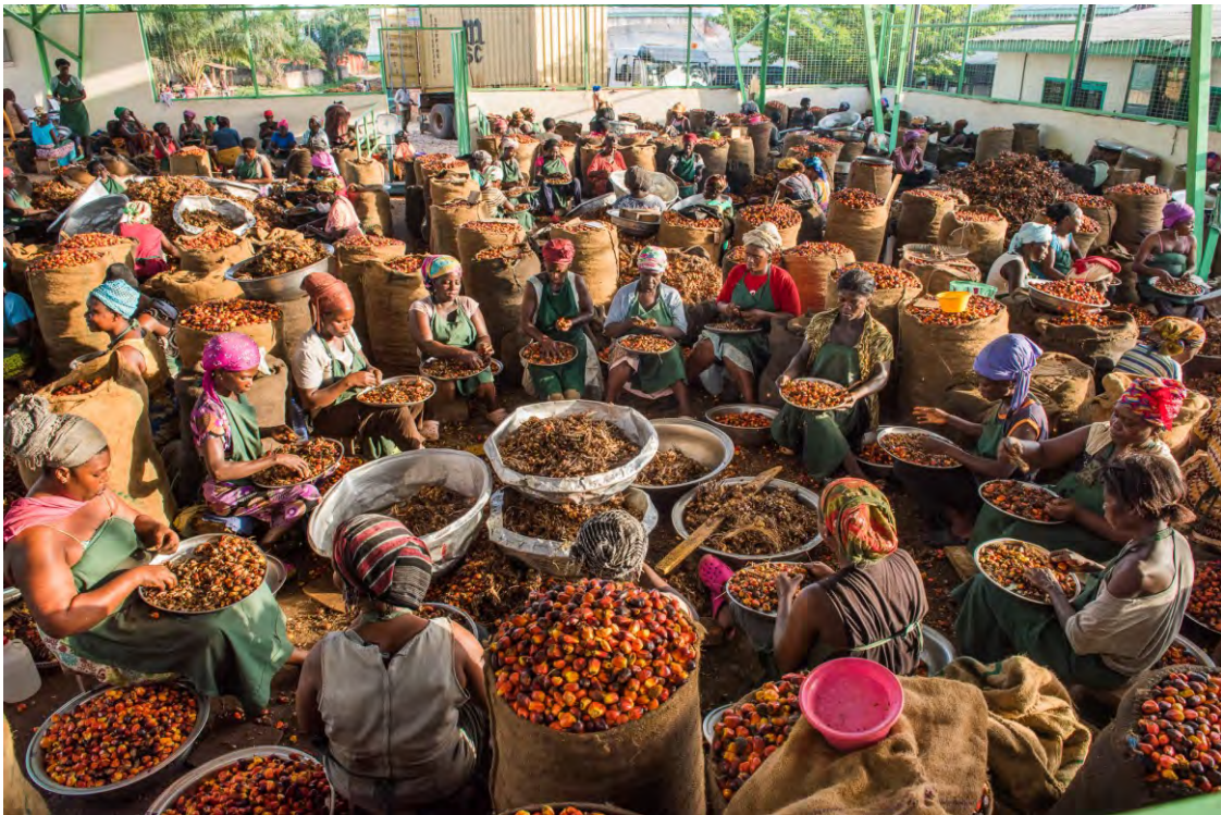
HAND IN HAND partner Serendipalm in Ghana: An exemplary women's project for the production of fair and organic palm oil