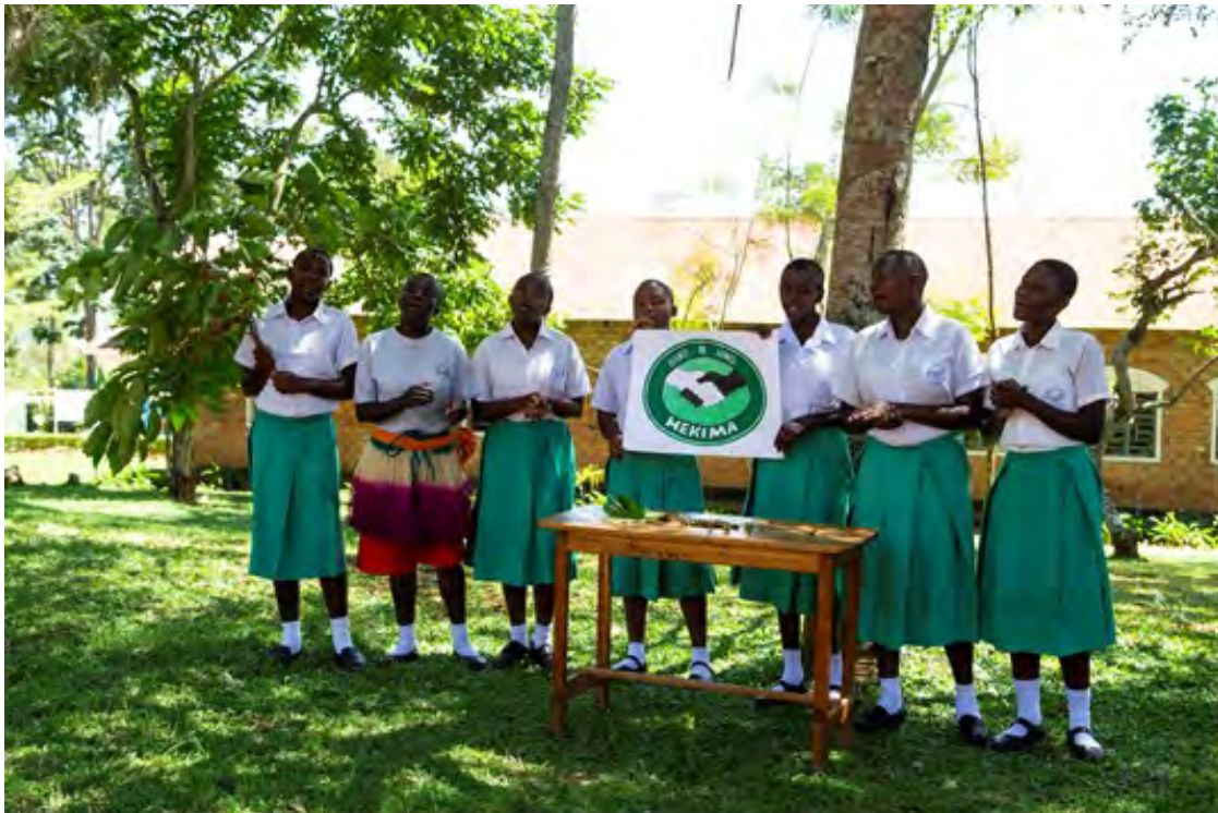
Hekima Girls' Secondary School in Tanzania has been supported several times through the HAND IN HAND fund due to their remarkable commitment

Funds are disbursed twice a year , in spring and autumn. In exceptional cases the committee may decide on applications any time of the year.