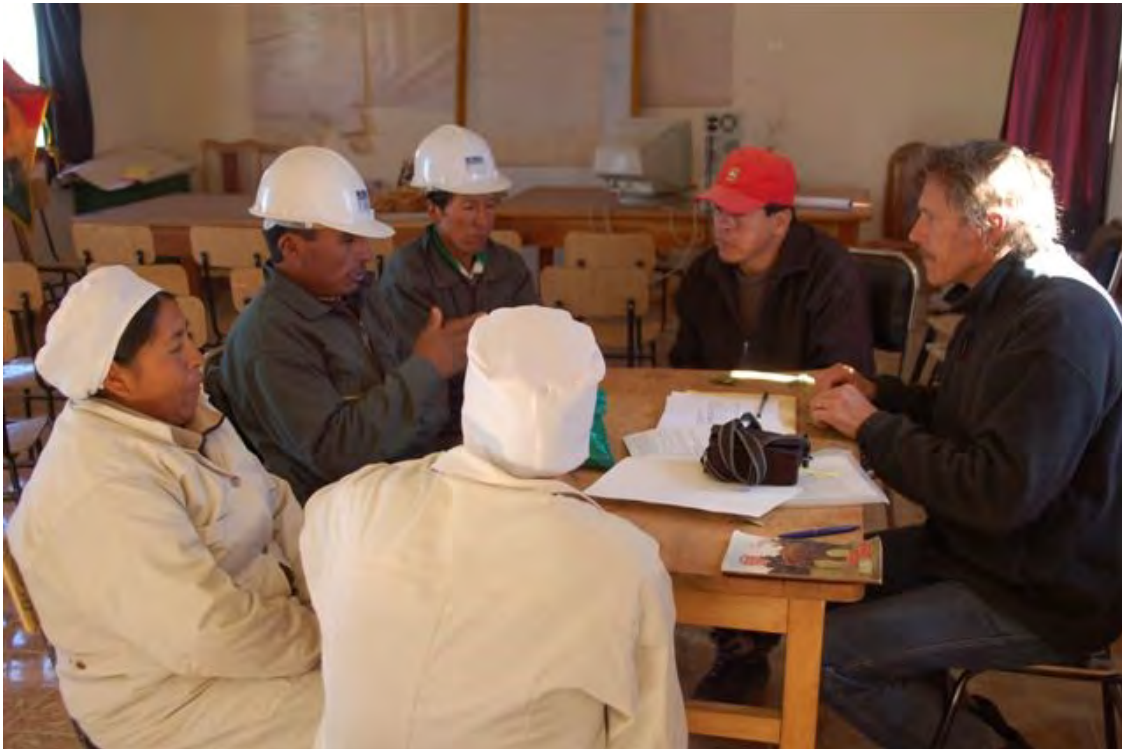
Quinoa processors, Bolivia HAND IN HAND inspection