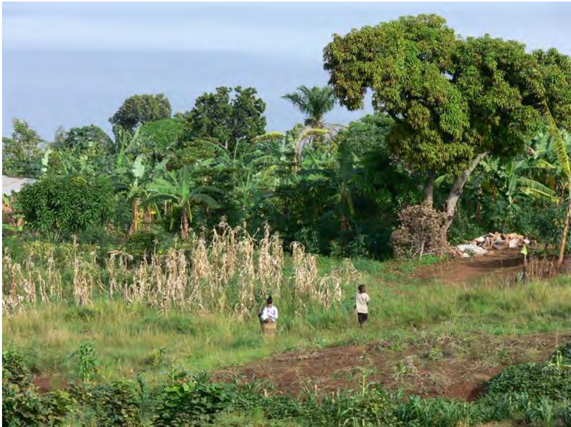
HAND IN HAND and organic: Coffee cultivation by the members of the small holder cooperative KCU in Tanzania