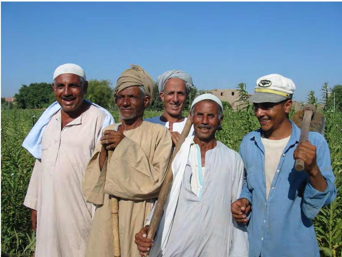
Organic and HAND IN HAND: Sesame farmers and farm workers of LOTUS / SEKEM in Egypt

(For criteria applicable to Rapunzel Naturkost please see 3.11)