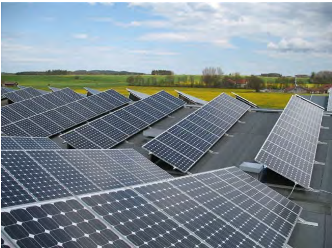
Solar energy from the Rapunzel roofs